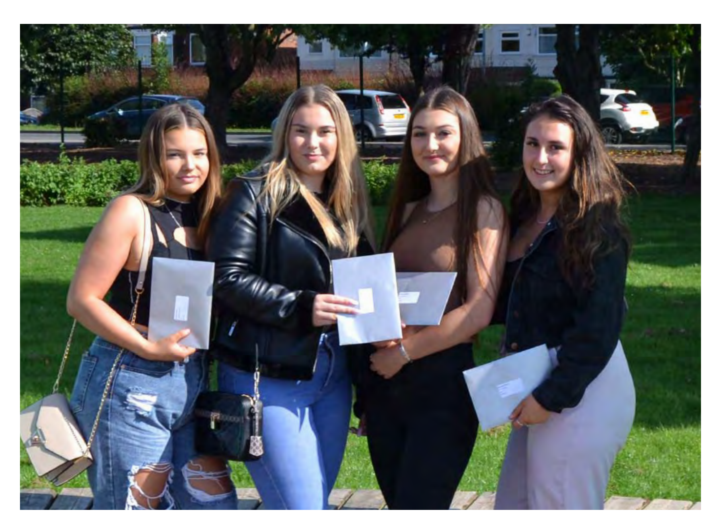
*The full results for the summer of 2021 will not be shared on any local or national basis this year and there will be modified published national school results for September 2021 for all schools nationally.

The post-16 data of our Year 11 students shows the extremely high academic standards achieved by the students and the school in their Maths, English, EBacc and choice subjects in the summer of 2021.