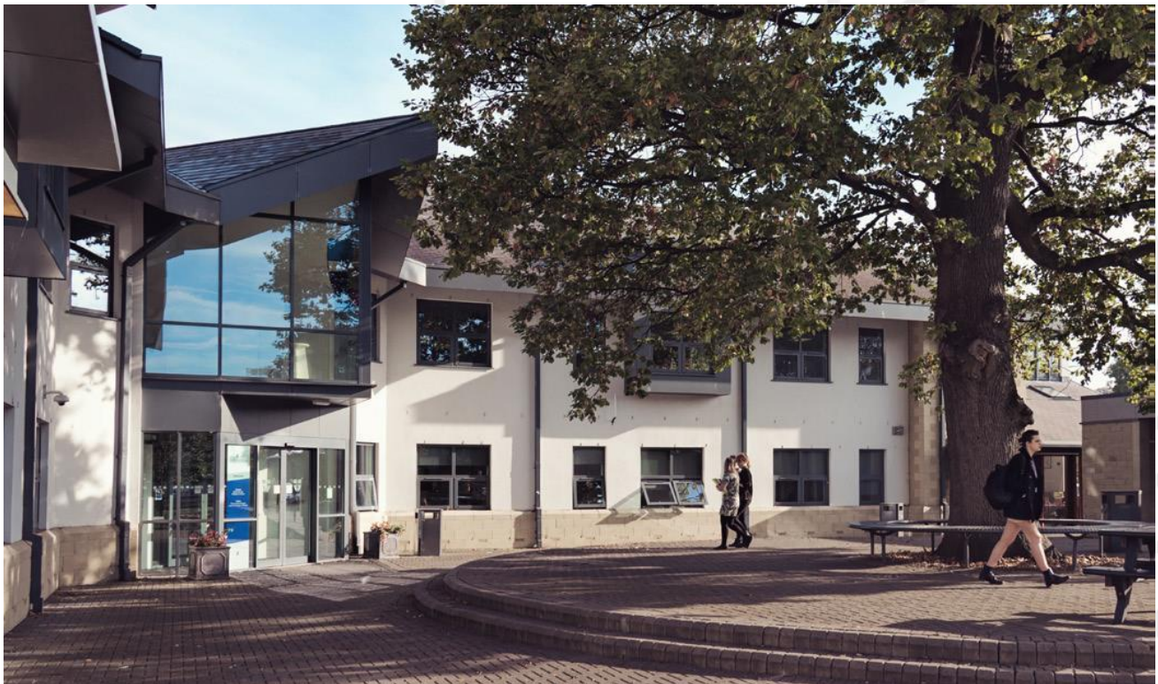
Sixth Form Centre

We have high expectations of our students and are committed to enabling each student to realise his/her potential. Our students are highly motivated, enthusiastic and able.