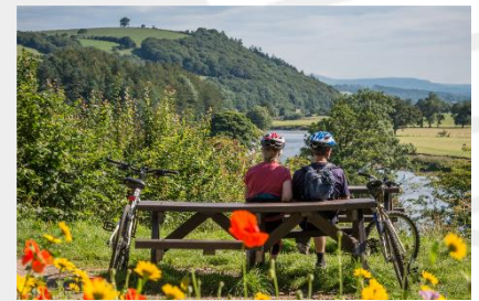
Crook O' Lune