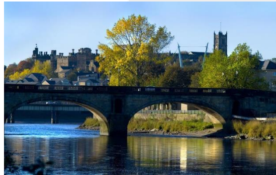
The Historic City

Despite being a university city and home to 138,000 people, over two thirds of Lancaster is classed as rural area. Surrounded by many pretty villages, it is a very pleasant place to live. Lancaster benefits from excellent rail and road links, indeed the school is easily accessed from the M6 motorway. The city offers the usual attractions of a vibrant place to live, but also has some beautiful areas of outstanding natural beauty on the doorstep. The coast is easily accessed; Blackpool, the beautiful Fylde Coast and Morecambe Bay are within 40 minutes' drive. The Lake District is 30 minutes away. Liverpool and Manchester are less than 1 hour away. London is less than 3 hours away by train, with Lancaster being a mainline west coast station, giving easy access to Scotland.