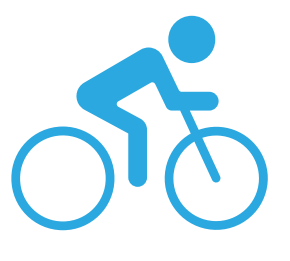
Cycle to Work Salary Sacrifice Scheme