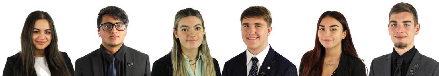
Our Head Prefect Team 2021-2022