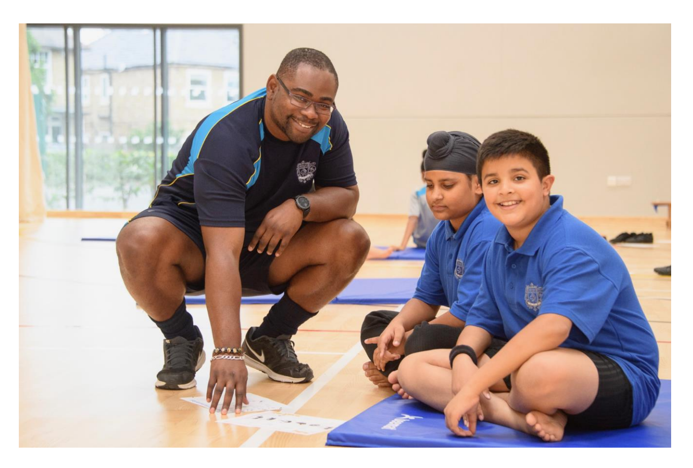
Applicants need to understand the context within which the school will operate. The following points highlight some of this context:

NSWL aims to improve educational attainment and broaden the curriculum to nurture spiritual and emotional wellbeing; promote family and faith virtues; and integrate families and community into education. The School also seeks to help to alleviate the shortage of school places and increase the diversity of education in Hounslow.