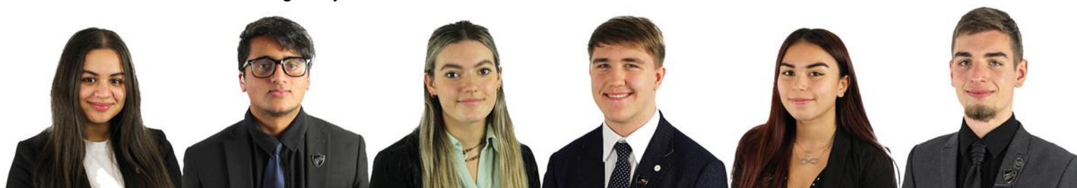
Our Head Prefect Team 2021-2022