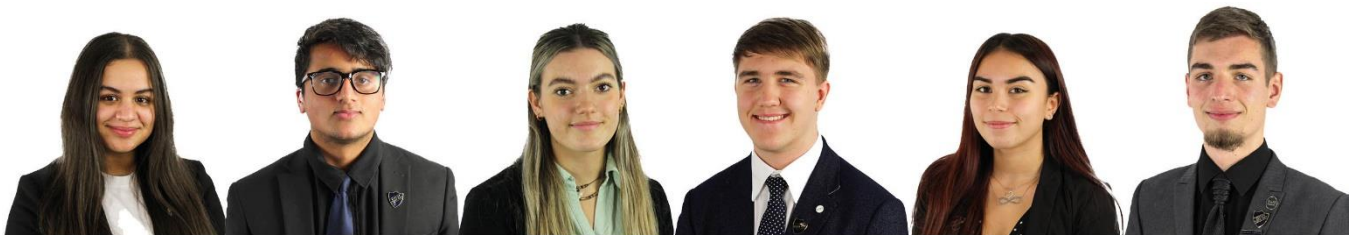
Our Head Prefect Team 2021-2022

Applications will be reviewed as they are received, and suitable candidates invited for interview. We reserve the right to withdraw this advert should a suitable candidate be appointed.