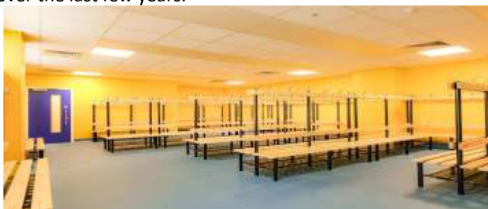
Nower Hill High School, brand new sports changing facilities

The more recent additions to our site are a superb 6 th Form Centre, a first class English teaching block (13 classrooms), an additional block of 5 modern Science labs (making a total of 16 Science labs) and an excellent Fitness Suite which is free for students and staff to use. The school site and buildings are well looked after with £4m being spent on new rooves, windows, heating, air conditioning and toilet blocks over the last few years.