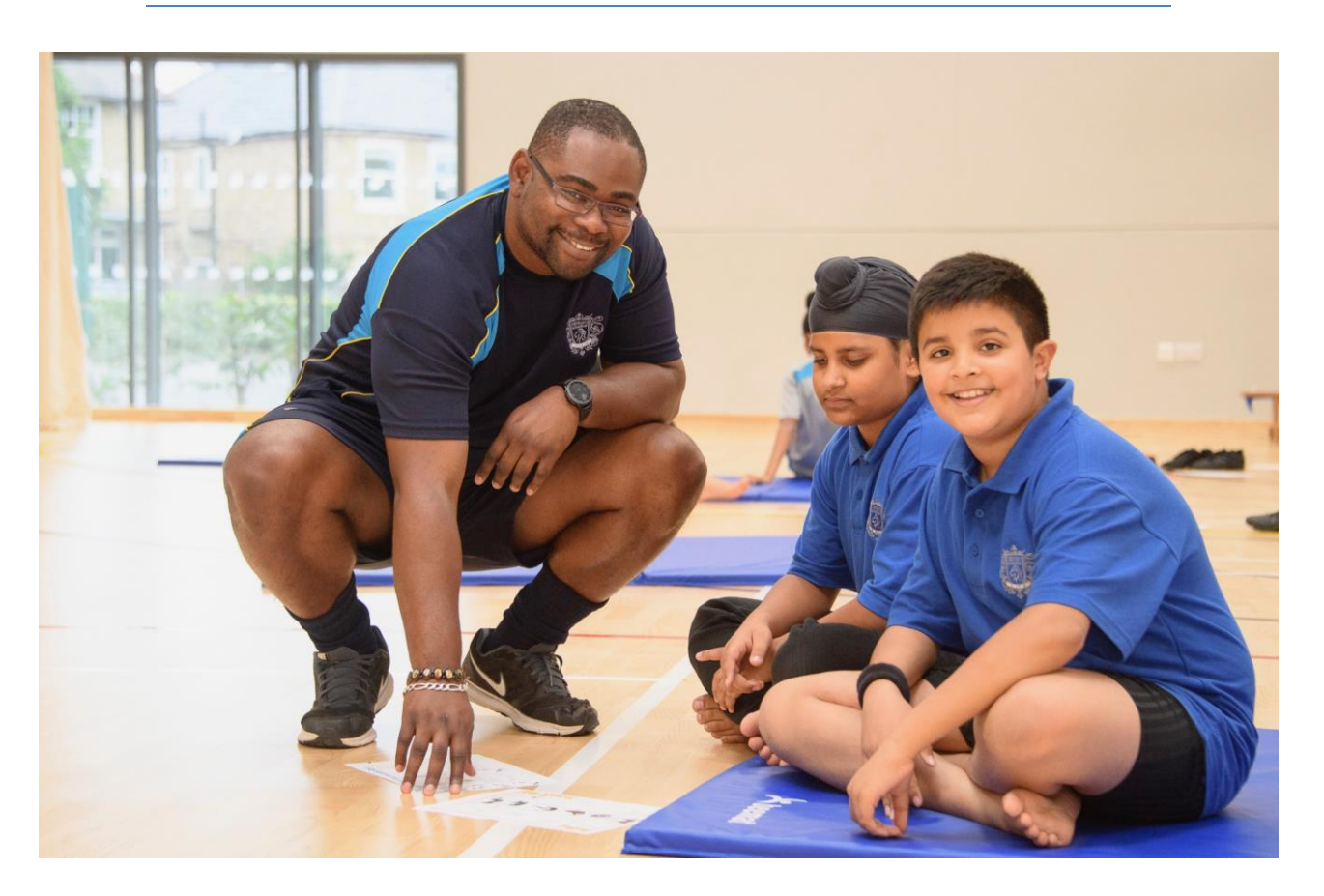
Applicants need to understand the context within which the school will operate. The following points highlight some of this context:

NSWL aims to improve educational attainment and broaden the curriculum to nurture spiritual and emotional wellbeing; promote family and faith virtues; and integrate families and community into education. The School also seeks to help to alleviate the shortage of school places and increase the diversity of education in Hounslow.