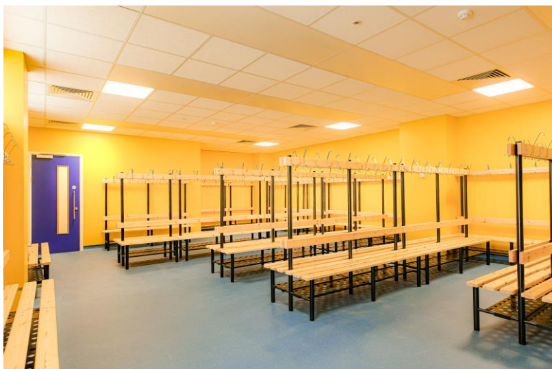
Nower Hill High School, brand new sports changing facilities

The more recent additions to our site are a superb 6 th Form Centre, a first class English teaching block (13 classrooms), an additional block of 5 modern Science labs (making a total of 16 Science labs) and an excellent Fitness Suite which is free for students and staff to use. The school site and buildings are well looked after with £4m being spent on new roofs, windows and toilet blocks over the last few years. There are further projects in the pipeline, including an expansion to our canteen facilities.