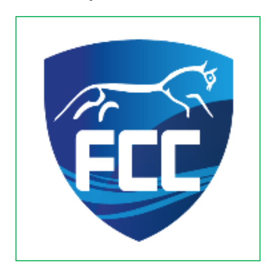
Values, Culture and Character

FCC raises aspirations, creates opportunities, develops character, and changes lives. Our core purpose is to provide everyone with the confidence to be the best they can be. Better people make better schools.