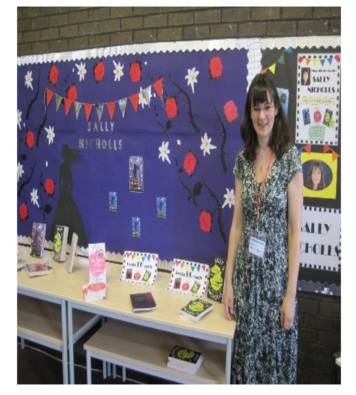
Reading is very important at FCC and all the books in our recently refurbished library are clearly identified with their Accelerated Reader level. We invite authors in on an annual basis.