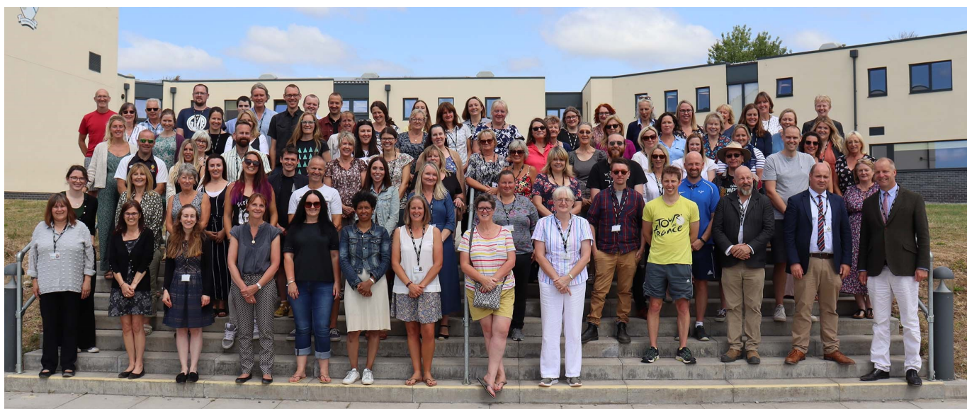
Academy staff photo taken at a recent inset day.

Chulmleigh College, Chulmleigh, Devon, EX18 7AA