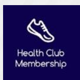
Health Club Membership

An offer to purchase an electric car by spreading the cost and also making savings on your Tax and National Insurance contributions via our salary sacrifice schemes.