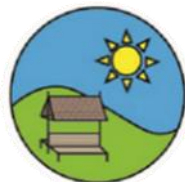
UFFCULME PRIMARY SCHOOL