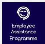
Employee Assistance Programme

Video or phone consultation with a GP at a time that suits you.