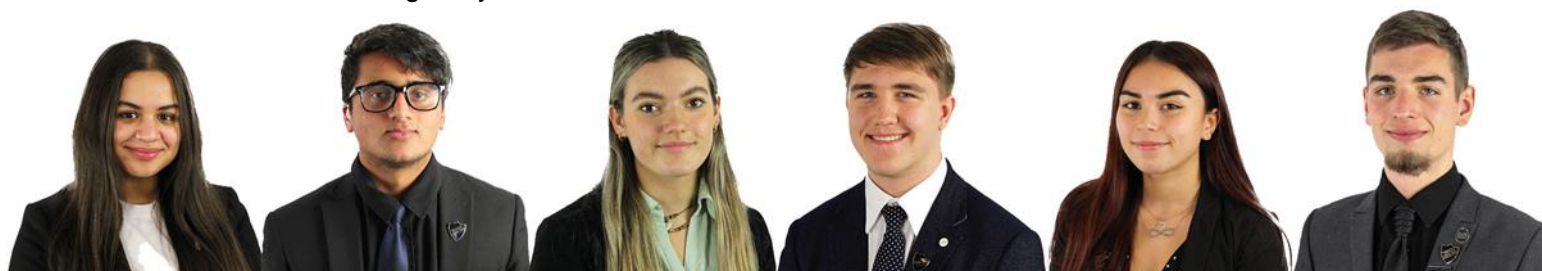
Our Head Prefect Team 2021-2022