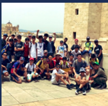
Córdoba trip in June 2019