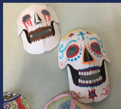
Día de los Muertos masks