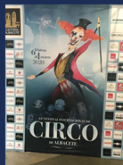
Spanish exchange to Valencia 2020