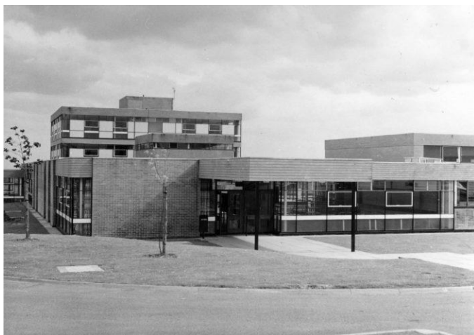
St Michael's School Main Entrance 1970

The School is popular and highly over subscribed, achieving outstanding exam results and is acknowledged by the Department for Education as being one of the most successful in the country.