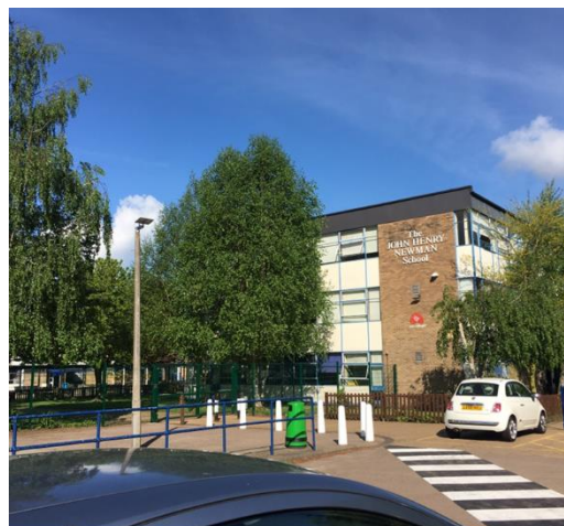
The current Main Block which will be demolished in 2024