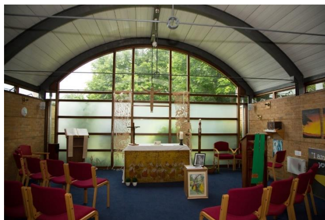
The School Chapel built in 1987