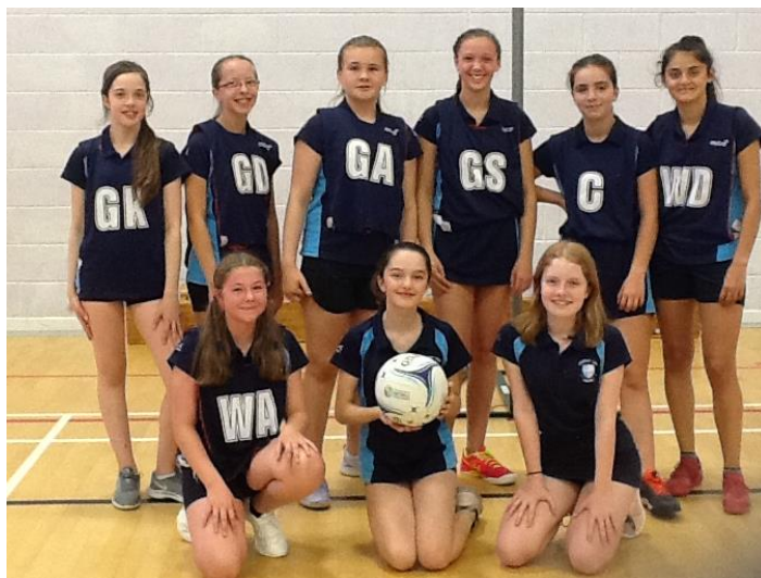
Year 9 Netball Team