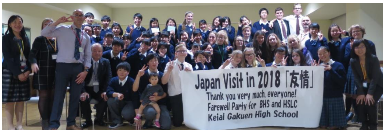
Japan Visit 2018

Beverley High School holds the YHGSA's Global Schools Award which recognises the international dimension in the school. All departments in the school are encouraged to incorporate international/global elements into their Schemes of Work. Opportunity for curriculum development exists, most notably with our link schools and colleges, Keiai Gakuen Senior High School in Chiba, Japan; Sujatha Vidyalaya College, Matara, Sri Lanka; Marcel Aymard College, Millau, France; and most recently Gymnasium Am Kothen, Wuppertal, Germany. Student and teacher visits to Japan and Sri Lanka are a part of school life and we are really hoping that we will continue to visit our links overseas as soon as regulations allow.