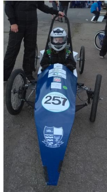
Green Car Project – Race Day