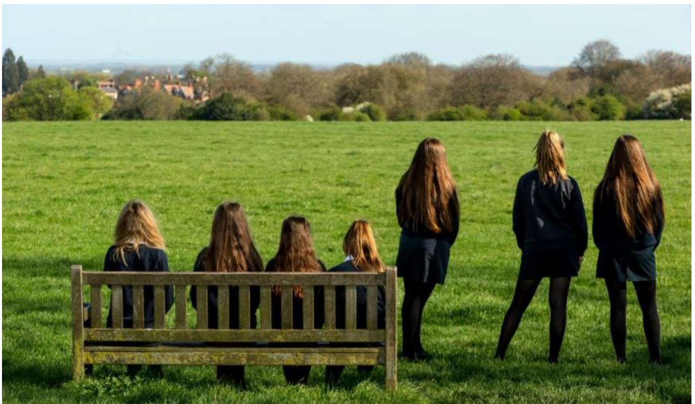
The Westwood, Beverley

Beverley High School is pleasantly situated in the centre of the attractive market town of Beverley in the East Riding of Yorkshire. The catchment area is socially mixed and provides a full range of ability, taking students from Beverley and the surrounding villages of Tickton, Walkington, Wawne and Woodmansey.