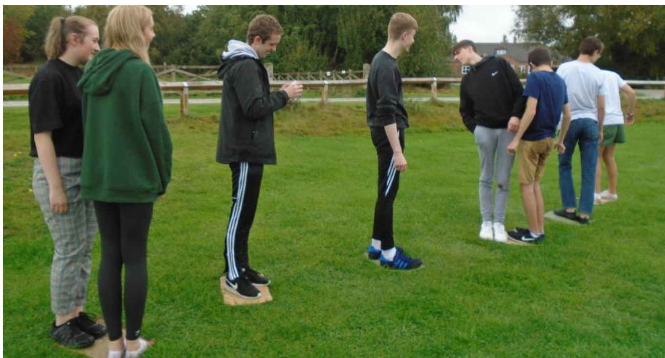
Joint Sixth Form Trip to Allerthorpe Lake

In September 1978 the Sixth Form was linked with our neighbouring boys' comprehensive, Beverley Grammar School. The teaching in most advanced level subjects is equally shared between the staffs of both schools. The scheme carries the advantages of widening the range of courses, provides larger numbers in teaching groups and a livelier academic life. Both schools have a lengthy and successful experience of sixth form work and students have benefited from this pooling of resources. Many students continue to Higher Education, including Oxbridge.