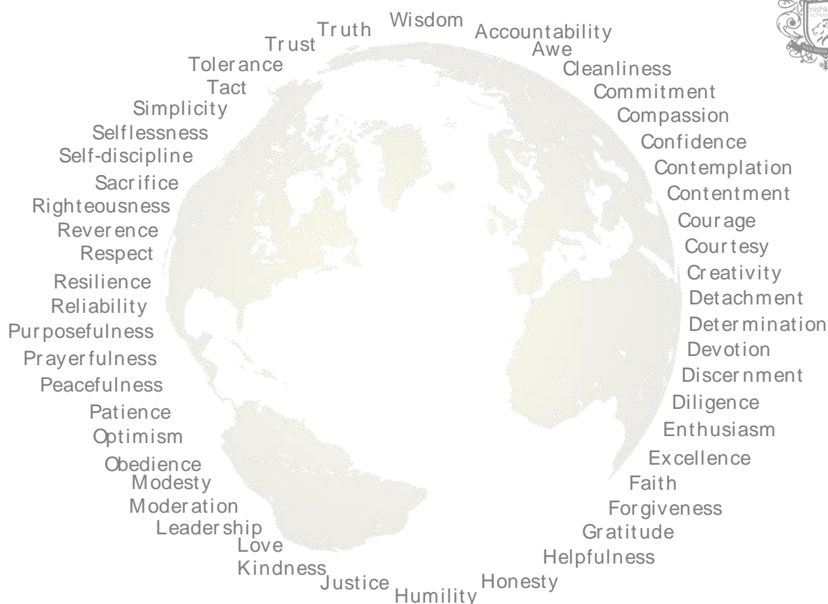
Nishkam Values Guide