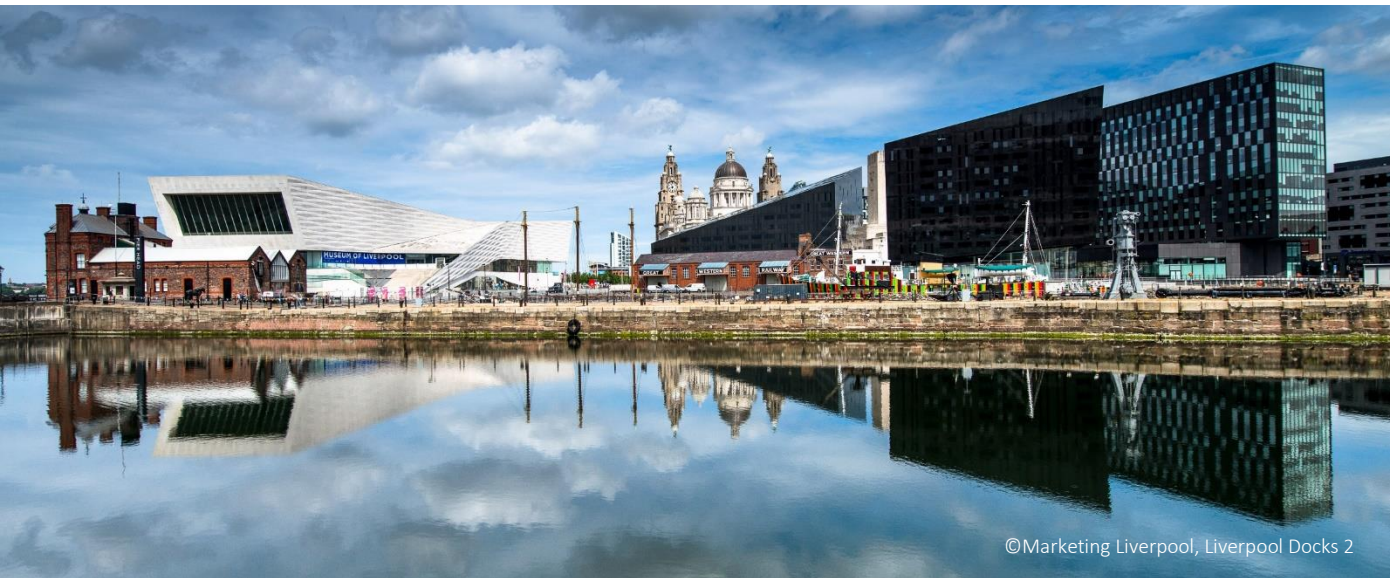
Liverpool Docks 2

Liverpool is a city with unique attractions, exciting events, world class sport offerings, unrivalled musical heritage and a famously warm welcome!