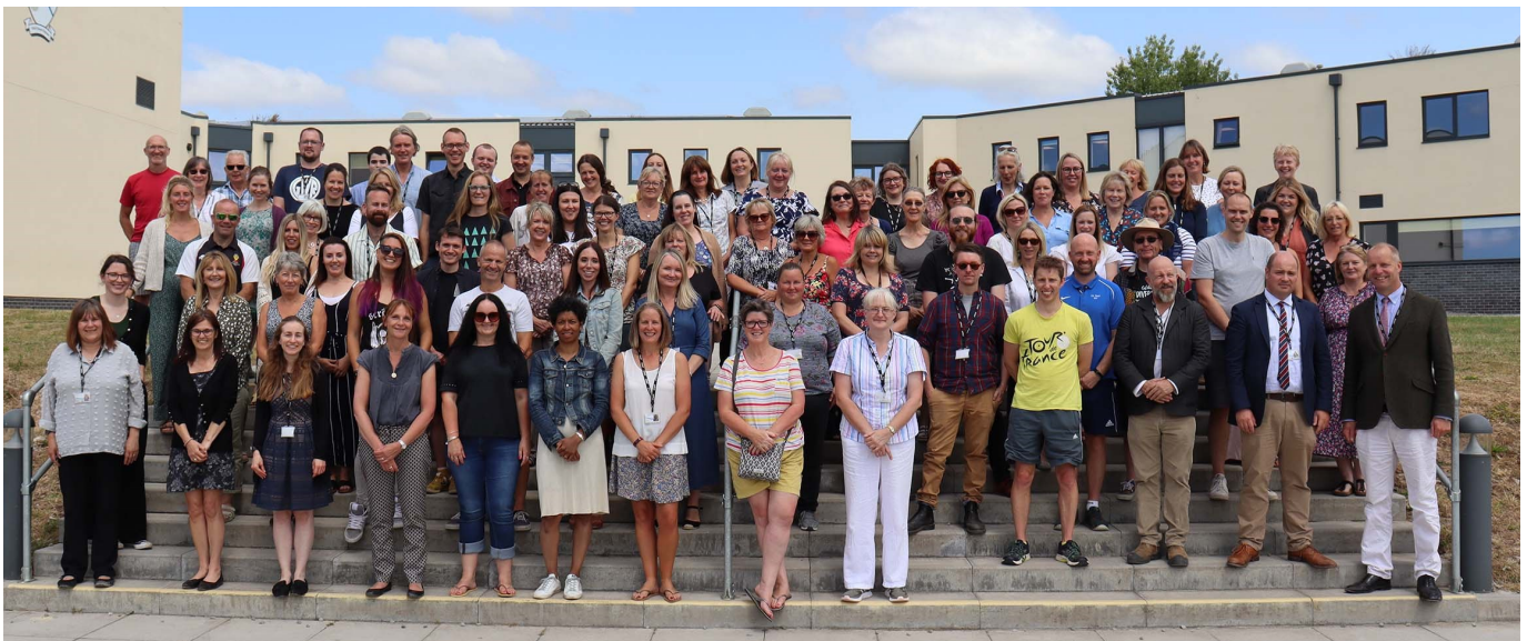
Academy staff photo taken at a recent inset day.

Chulmleigh College, Chulmleigh, Devon, EX18 7AA