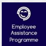
Employee Assistance Programme

Video or phone consultation with a GP at a time that suits you.