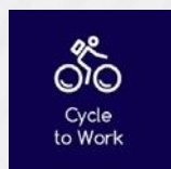
Cycle to Work

An offer to purchase home technology and personal electronic devices by spreading the cost and also making savings on your Tax and National Insurance contributions via our salary sacrifice schemes