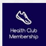
Health Club Membership

An offer to purchase an electric car by spreading the cost and also making savings on your Tax and National Insurance contributions via our salary sacrifice schemes.