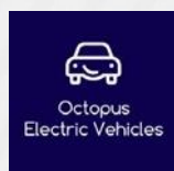
Octopus Electric Vehicles

An offer to purchase a cost effective way to get new cycling equipment and bicycles by spreading the cost and also making savings on your Tax and National Insurance contributions via our salary sacrifice schemes.