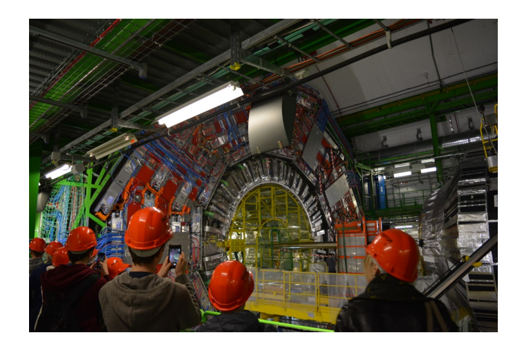
Students visiting one of the detectors in the Large Hadron Collider in Geneva, Switzerland Feb 2017

At Key Stage 5 , the number of A level passes at grade C and above in Biology, Chemistry and Physics were 67%, 60% and 56% respectively.