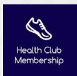
Health Club Membership

An offer to purchase an electric car by spreading the cost and also making savings on your Tax and National Insurance contributions via our salary sacrifice schemes.