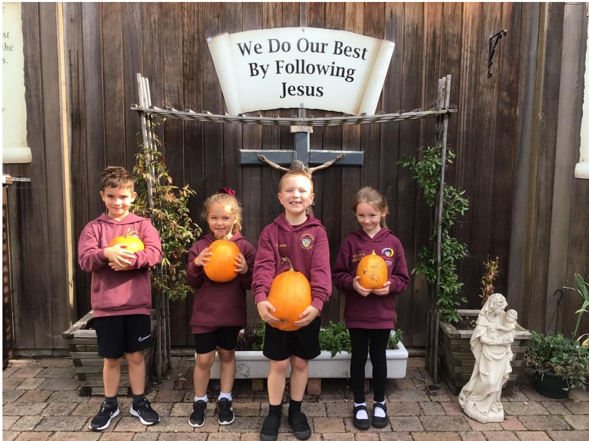
St Ambrose Gardening Club showcasing their home grown produce.