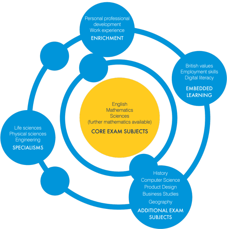
Key Stage 4